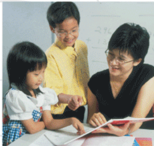
CEFL – a place where students and teachers have close rapport