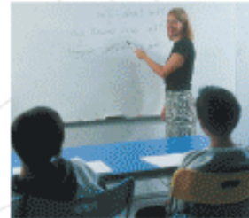
Time spent in class is of maximum benefit

CEFL's courses provide for development of all the language skills and the Cambridge exams test each skill so that learners have a detailed measure of their proficiency. Each learner is