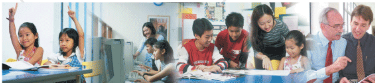
Tutorial sessions at CEFL – where learning comes alive