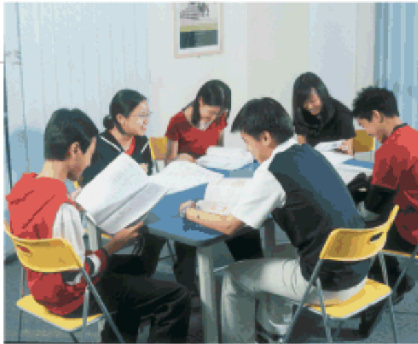
Students engrossed in syndicated work

pre-tested and placed on a course at a level appropriate to his/her proficiency. So, for example, a learner at elementary level would be placed on a course of study leading to the Key English Test (KET) the first of the Cambridge ESOL Main Suite of examinations. Thereafter the learner can progress from one level to the next, eventually reaching the highest level examination, the Certificate of Proficiency in English (CPE) which meets the English language entrance requirements of institutions of higher learning worldwide and is also widely recognized by employers all over the world as an indication of a high level of proficiency in the language.