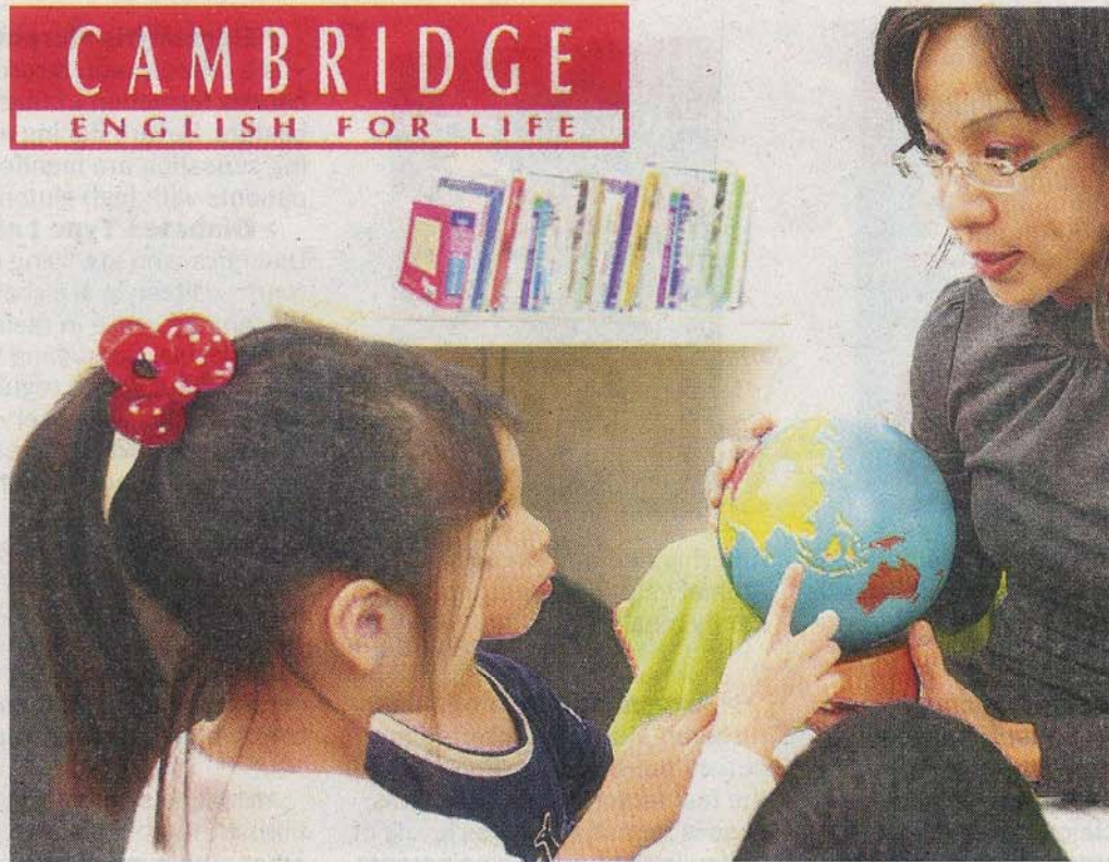
Cambridge English For Life takes a holistic approach to teaching and learning English.

All four skills are addressed and grammar is learned inductively, which means that it is acquired in context and not as a separate subject as it used to be. The language skills are inevitably interrelated. A single skill taught in isolation cannot