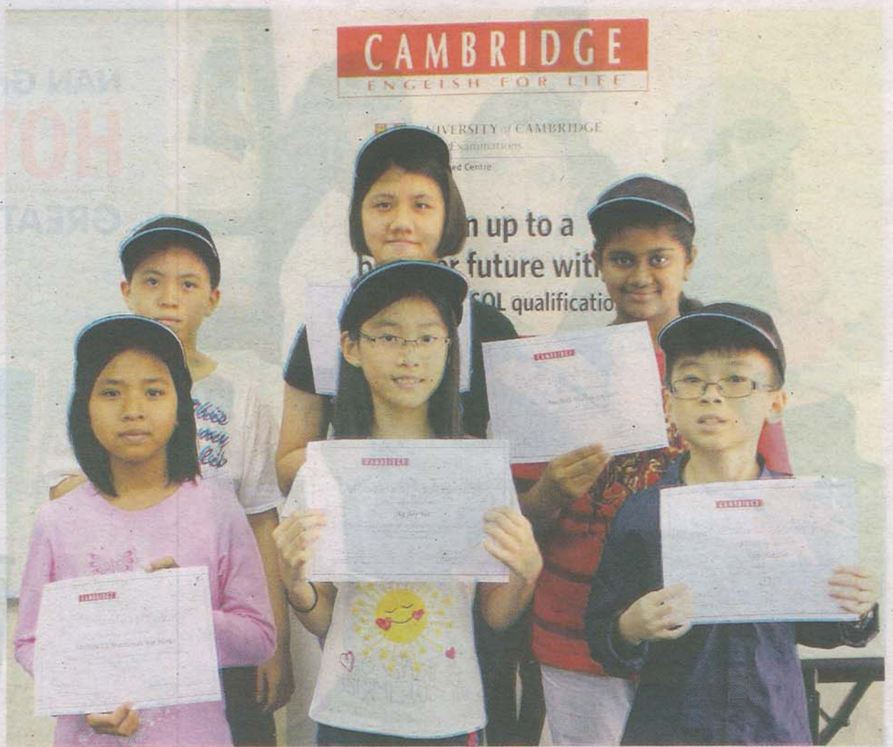
To be a good language learner, one must be aware that a language cannot be mastered overnight – it will take time and effort to become proficient.

A good language learner thinks about her learning method – what works for her and what doesn't. For example, she will try out different ways of learning vocabulary until she finds the way that suits her best.